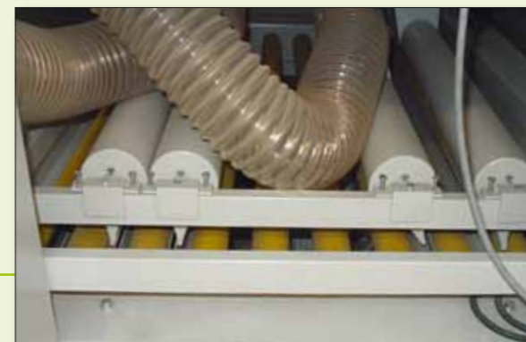
Jet cooling zone with outfeed roller