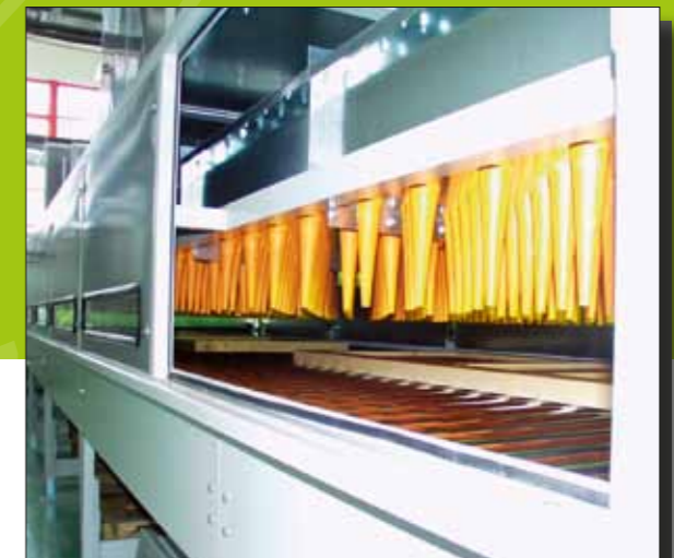
Finishing Line, 1300 mm, with Jet Drying Zone