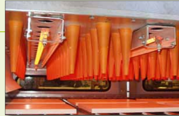
Jet drying zone with IRK lamp